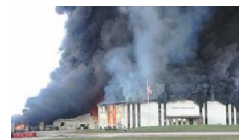
Euclid Chemical Fire