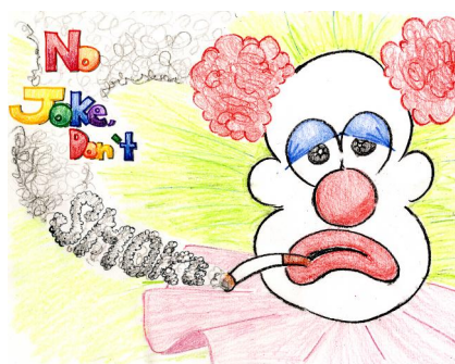
2010 Tar Wars Winning Poster

The Dental Clinic serves the dental needs of families (children & adult) receiving Public Aid, All Kids, or those that qualify under low-income guidelines. Through relationships with dental specialists, we are often able to make referrals to their practices for selected cases at little or no cost to the patient.