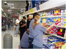
Sticker Shock Program

CPASA is a group of community partners started from the health department's 2007 IPLAN. Today the coalition has over 40 engaged, active members working together to decrease youth underage drinking, tobacco use and the abuse of marijuana, prescription drugs and inhalants.