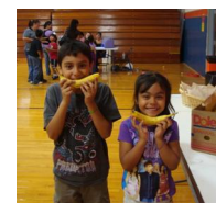
Depue Health Fair

-US Centers for Disease Control & Prevention-